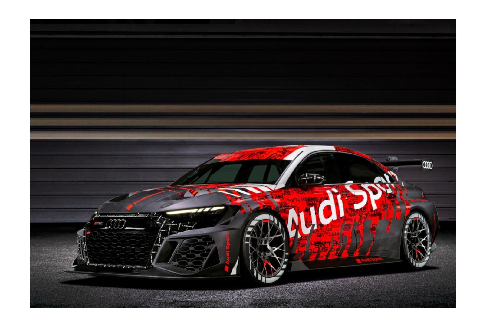
Engine BOP regulations & Marelli license Audi RS 3 LMS MY2021